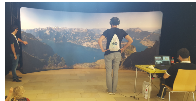
Figure 2: Demo of the gaze-based tourist guide for a panorama wall (exhibit at science fair).