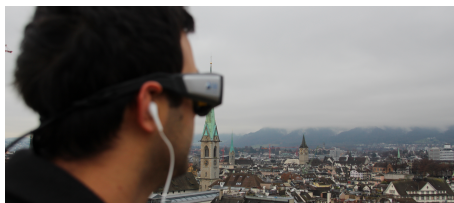
Figure 3: Gaze-based tourist guide for a city panorama.